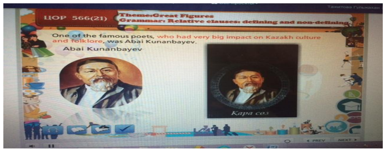
Fig.1 Great Figures