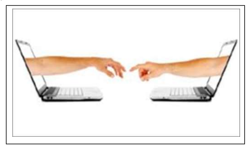
Fig. 3: Genesis of Computer-aided Cross-cultural Communication Theory

communicate, in similar and different ways among themselves, and how they endeavor to communicate across cultures (Gudykunst, 2002). In relation to Computer-aided Cross-cultural communication theory, the researcher underscored the statement that says "people from different cultural backgrounds communicate, in similar and different ways among themselves, and how they endeavor to communicate across cultures". Indeed, the current theory amplified the words "different ways" as it connotes practicality, sensibility and efficiency. Why practical, sensible and efficient? Given the concept of internationalization where people are now living in one global village and where technology is always connected in almost everything people do, it can be assumed that people will be left behind or expire in isolation if they will not accept the benefits provided by modern communication technology. Why cogitate distance as reason for isolation when CAC can make the necessary connection? Why stay alone when technology can provide better companion? And, why limit interaction with just one person or a segment of the society when there is an enormous opportunity to reach out to different kinds of people around the globe in just one click of the mouse? Indeed, CAC can facilitate the indispensable interaction while providing all kinds of methods available for communication.