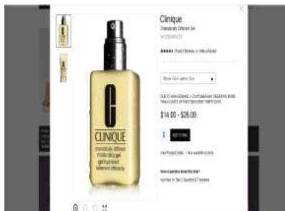
Fig. 2: Saks Fifth Avenue shopping page