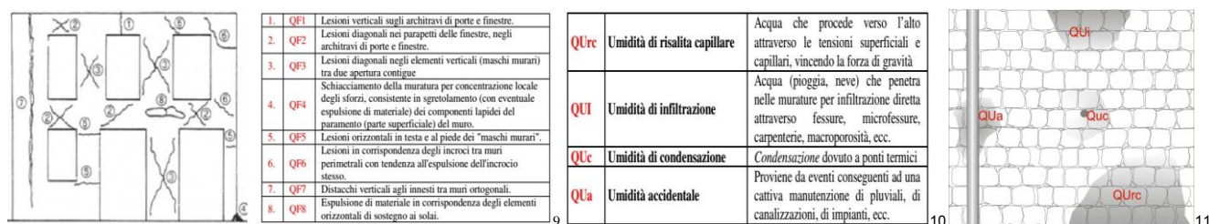
Fig. 9 - 10: Frameworks Sheet of crack patterns of the walls (QF) -from the Ministry of the Interior Circular No. 28/1991, and supplemented by specific classification. 11 - 12: Detection of wet patterns (QU)

Reading the conditions of degradation of natural stone materials (DMLN) - In the first level of survey you develop a reading of all the particularities of the stone elements which have importance for the purposes of a first diagnosis on macroscopic alterations: colour, crystal habit, cleavage planes, sedimentation levels, pathologies of degradation, etc. Then you can draw a map, so that the overlap will highlight the state of alteration and degradation, while identifying the intrinsic and extrinsic causes, direct or indirect, generating pathologies. The procedures, terminology and practices to be adopted for the preparation of the degradation relief will refer to NORMAL 6 recommendations on natural and artificial stone materials. This survey will be open to further investigation, in a second-level analysis in which you can use other tests to determine the following necessary diagnostic tests. Based on the information acquired in the first level of investigation, in fact, you can perform in-depth analysis, the least destructive, useful to accurately determine all the causes of the alterations, the physical-chemical characteristics of the material and of chemical and physical agents that have determined the state of degradation.